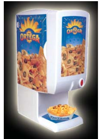
Ortega Cheese Dispenser... the machine, the legend