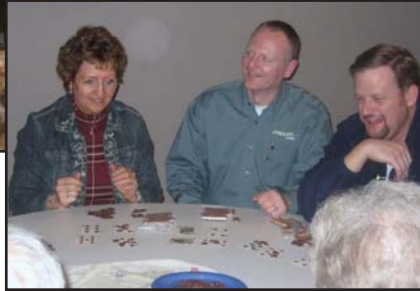
4: Rich, the purse you got in the Christmas gift exchange would complete the ensemble quite nicely (alternative caption: be on the lookout for club members wielding adult beverages and cameras).